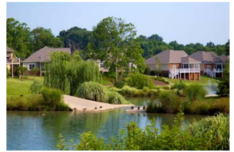
Hunter's Lake Community