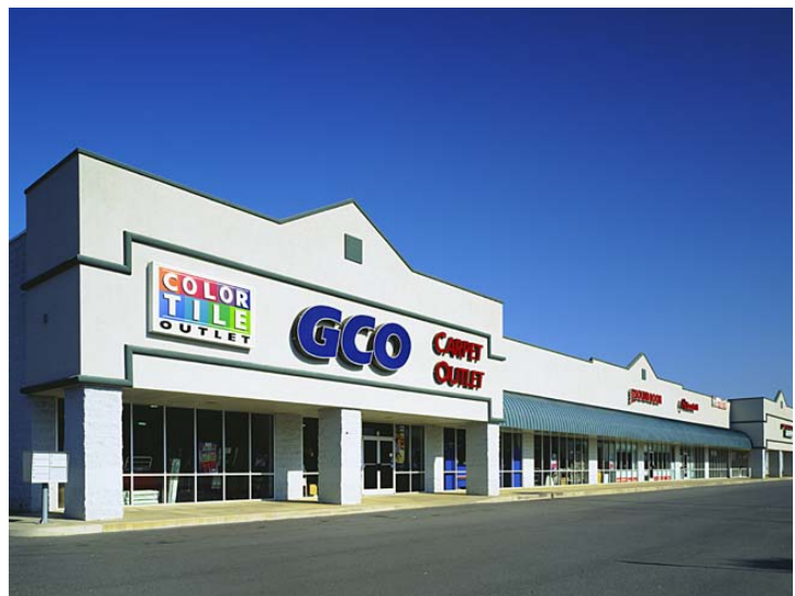
KNOB CREEK MARKETPLACE - JOHNSON CITY

At Mitch Cox Construction, Inc., we know that quality, budget, and scheduling drive the construction market. We also strongly believe that honesty, integrity, trust, and a genuine concern for people play a vital role in our relationships with our clients. We proudly serve our owners with the full commitment of our resources for the success of their projects.