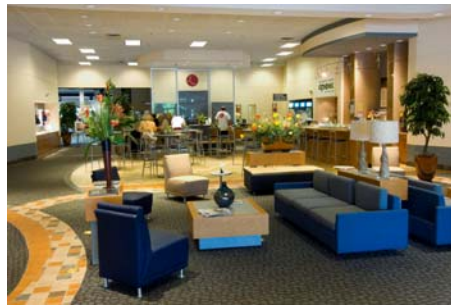
Johnson City Health & Fitness Center