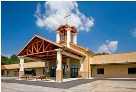
Cherokee United Methodist Church